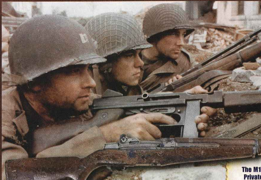
The M1 Garands used by extras in the movie "Saving Private Ryan" appeared similar to the real one that Matt Damon used, but were actually made of rubber for durability and reduced cost.

I hope that you have a chance to come by and see this once-in-a-lifetime peek into the magic that is Hollywood. The exhibit has dozens more interesting firearms from the Reel Heroes of the silver screen and they will be on exhibit until Dec. 31, 2002. The museum is located at the NRA headquarters, 11250 Waples Mill Road, Fairfax, VA 22030-9400, and it is open seven days a week 10 a.m. to 4 p.m. Call (703) 267-1602 for more information on tours and visits. ✓